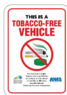
5" x 7"

"Schools should be a safe haven for kids and teens from the sights and smells of smoking, vaping and dip," said Ben Chandler, FHKy president and CEO. "We advocated for this law because the research shows it will protect kids from secondhand smoke and reduce youth tobacco use. Placing readily recognizable tobacco-free schools signs on campuses across the state will remind students, staff, faculty and entire