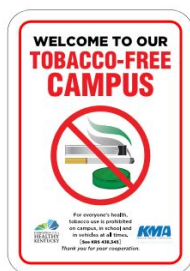
7" x 10"