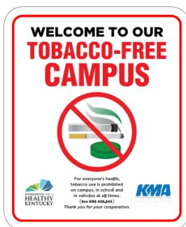
10" x 12"

implementing the new law and significantly help improve community compliance.